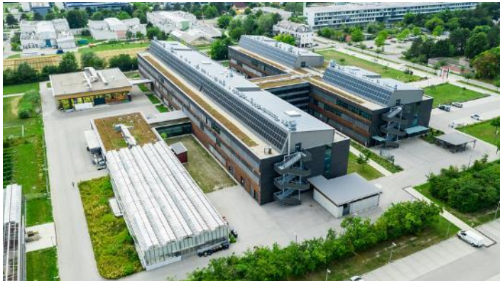
Tulln, 40km from Vienna