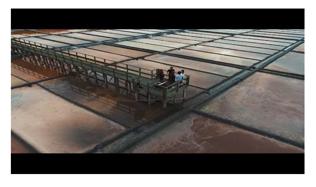
(double click to see the video)