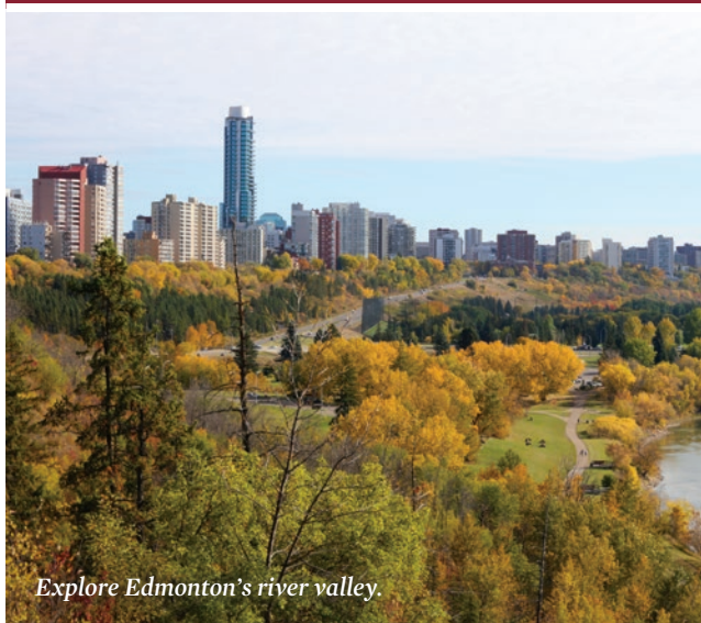
Explore Edmonton's river valley.