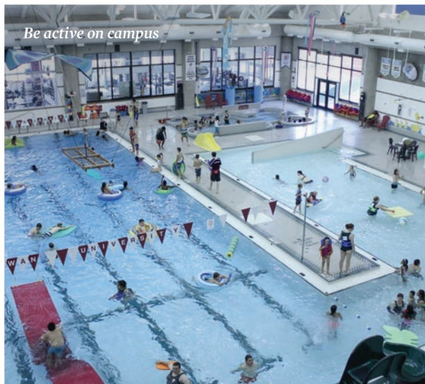
Be active on campus