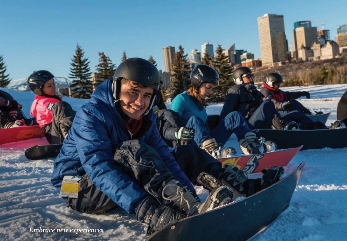
Embrace new experiences