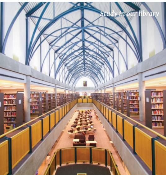
Study in our library

“I met so many people from all over the world. I enjoyed a lot of awesome events and festivals, such as Halloween, Thanksgiving Day, the Christmas party, Canada Day and a variety of summer festivals, like Heritage Festival. All of them were amazing and memorable. Even going to out at nights, living in residence with a roommate, going to the school every day was memorable for me.”