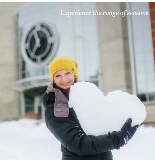
Experience the range of seasons