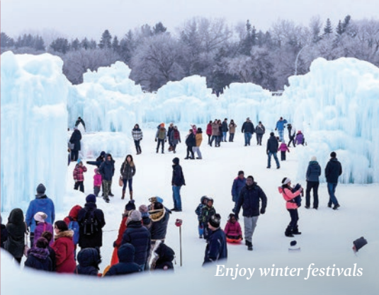
Enjoy winter festivals