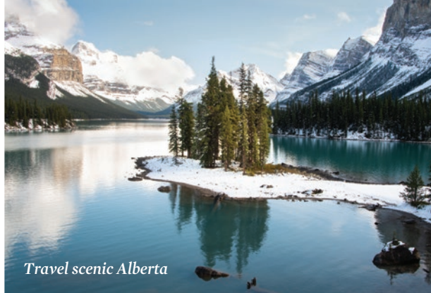
Travel scenic Alberta